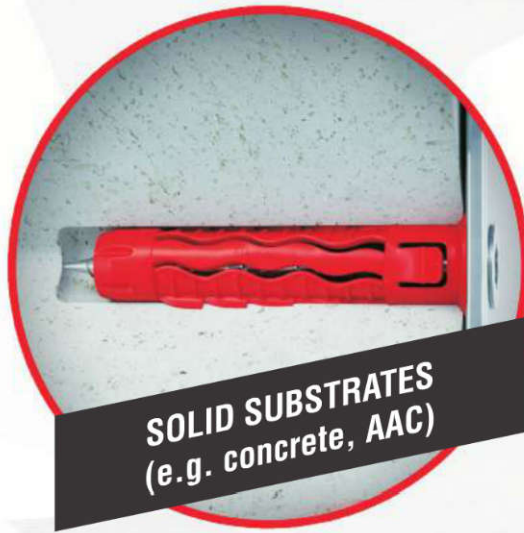
SOLID SUBSTRATES (e.g. concrete, AAC)