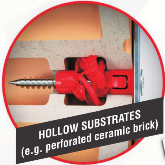
HOLLOW SUBSTRATES (e.g. perforated ceramic brick)