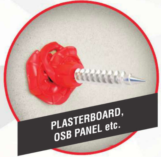
PLASTERBOARD, OSB PANEL etc.